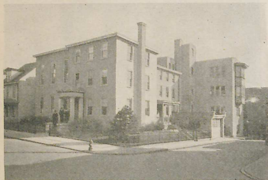
THE OFFICE OF THE ASSOCIATION 100 E. PRICE STREET, GERMANTOWN, PHILA., PA.