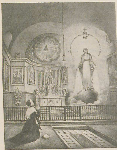
THIRD APPARITION—MANIFESTATION OF THE MIRACULOUS MEDAL TO SISTER CATHERINE. (See page 6.)

vision of St. John the Apostle, who wrote that "A great sign appeared in Heaven, a woman clothed with the sun, and the moon under her feet, and on her head a crown of twelve stars."