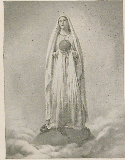
APPARITION OF MARY IMMACULATE TO SISTER CATHERINE

The front of the Medal represents Mary standing on the earth, her feet crushing a serpent, and her hands outstretched to all those who ask her assistance. Mary is Queen