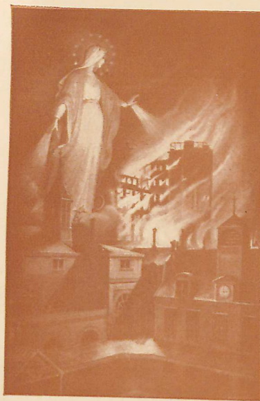
A RAGING fire near the Mother-house of the Daughters of Charity, where the apparitions of our Lady of the Miraculous Medal took place, threatened that Shrine, but an appeal to Mary Immaculate was followed by a strange and sudden change in the wind that ended the danger.