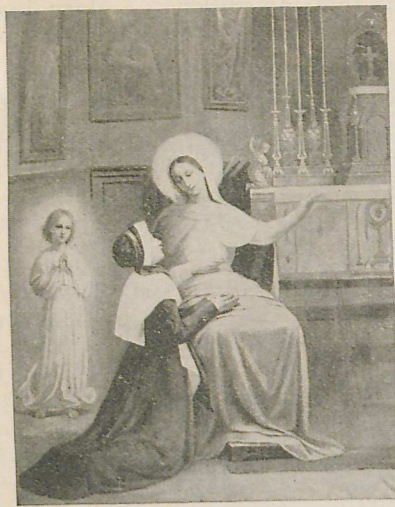
FIRST APPARITION OF MARY IMMACULATE TO SISTER CATHERINE

Some weeks afterwards she recognized the exact likeness of the venerable priest in a portrait of St. Vincent de Paul in the house of the Daughters of Charity at Chatillon. At