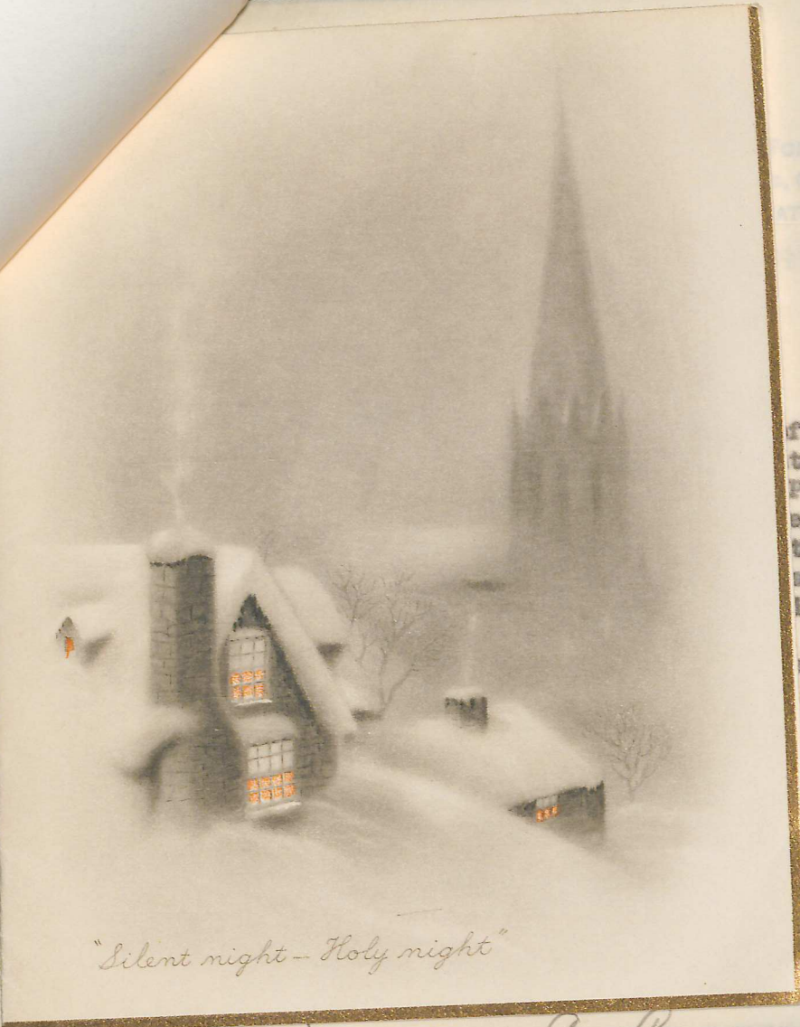
"Silent night - Holy night"