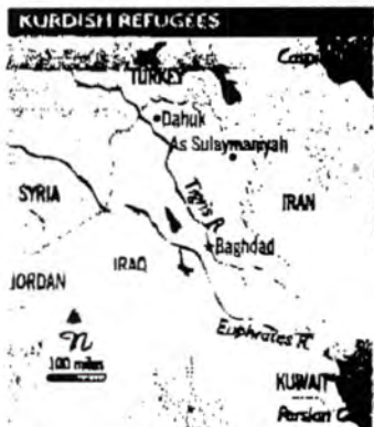
More than 6,500 Kurds with U.S. ties were evacuated from northern Iraq last year. During the Gulf War, they had worked for the U.S. military, the CIA and U.S.-funded relief organizations. They all moved to the United States, with about 500 settling in metro Atlanta.

He is willing to wait for responses to dozens of letters written by church members to the White House, members of Congress, the INS and the State Department. But his wife says she is losing patience. "I cannot wait any more. If things don't work out, I have no choice. I'll have to go back."