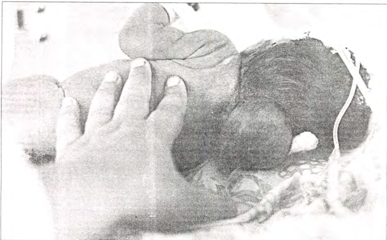
Deformed ... (right) a baby beng treated for a congenital head growth; and (above) a mother tends her child, who has leukaemia