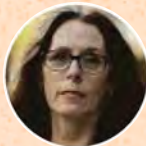
Laurie Halse Anderson