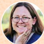
Kimberly Brubaker Bradley